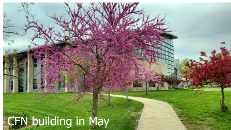
CFN building in May

Contact: Yukiko Yamada-Takamura (yukikoyt@jaist.ac.jp)