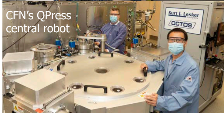
CFN's QPress central robot